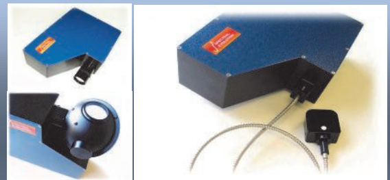
SM-3500 with included foreoptic, optional integrating sphere and fiber optic & right angle diffuser