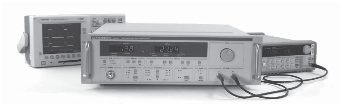
LDX-36000 Series instruments accept an external trigger to synchronize the output pulse.