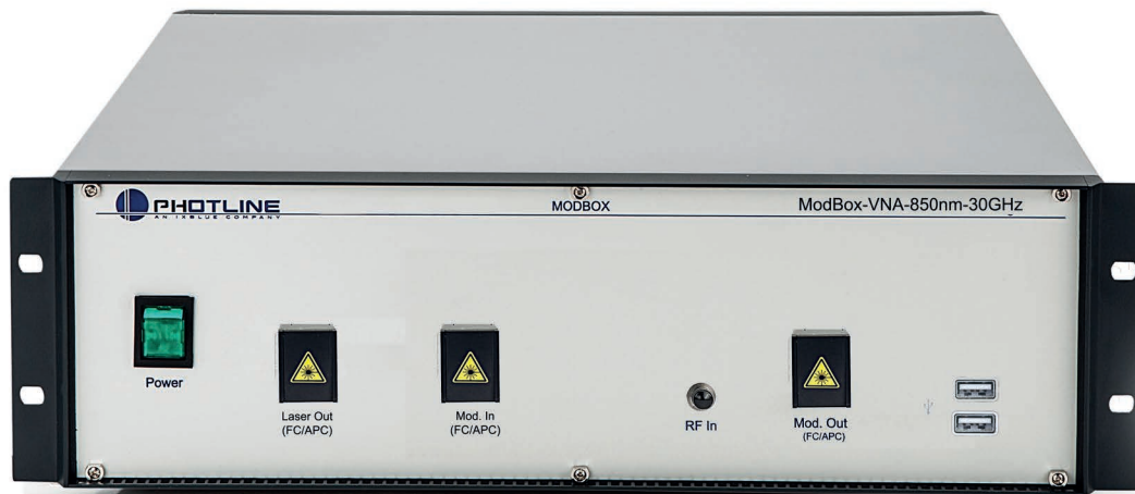
Non contractual ModBox front panel picture